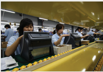
罗斯蒂苏州车间 Rosti China Workshop