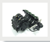
罗斯蒂的产品 Rosti Products