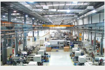
罗斯蒂苏州车间内景 Rosti China Workshop Overview