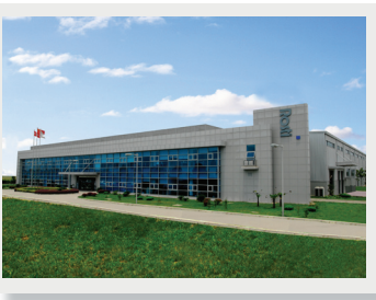
罗斯蒂苏州工厂全景 Rosti China Company Overview

罗斯蒂提倡主动积极的团队合作精神。公司尊重和珍视每位员工，通过内部培训和晋升机制助力员工的职业发展。在努力实现效益增长的同时，罗斯蒂也致力于履行企业的社会责任，积极投身环保、助学、校企合作等公益项目。公司还通过年会、旅游、家庭日、体育比赛等活动拉近员工之间的距离。希望大家快乐工作、健康生活，与公司共同成长！