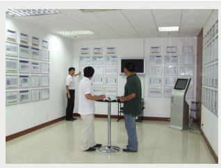
罗斯蒂苏州客户数据中心 Rosti China Customer Care Centre