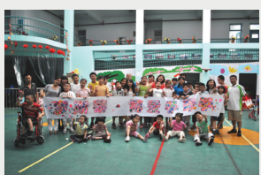
公司活动 Company Activities

Since 1944 Rosti has developed, manufactured and supplied plastic products. Today Rosti is a truly global company with 1800 employees and with production sites in Sweden, Germany, Scotland, the Netherlands, Poland, India & China. Since March 2010, Rosti has been a wholly owned subsidiary of Nordstjernan.